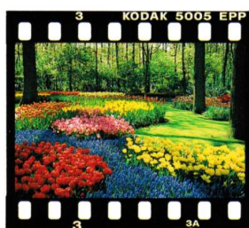
35mm format (actual negative size: 24 × 36mm)