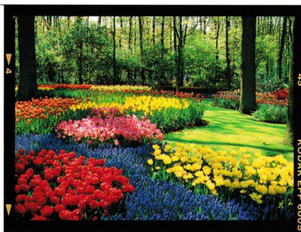
6 × 4.5cm format (actual negative size: 56 × 41.5mm)

With a film area almost three times that of conventional 35mm film, the 6 × 4.5cm format provides an enormous enhancement of resolution, color saturation and total image quality. In addition, the 4:3 proportion of the frame conforms to the classical "ideal" of artistic scale and perfectly matches conventional publishing requirements.